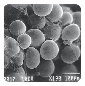
Healthy adipose cells at 0 minutes

The laser works as a natural alternative for fat loss by using low level lasers to create a temporary pore in the fat cells, allowing the fatty liquids to seep out of the cell and be naturally flushed out through your lymphatic system.